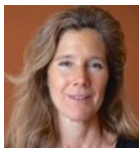
Tawn Beliger Beligert@